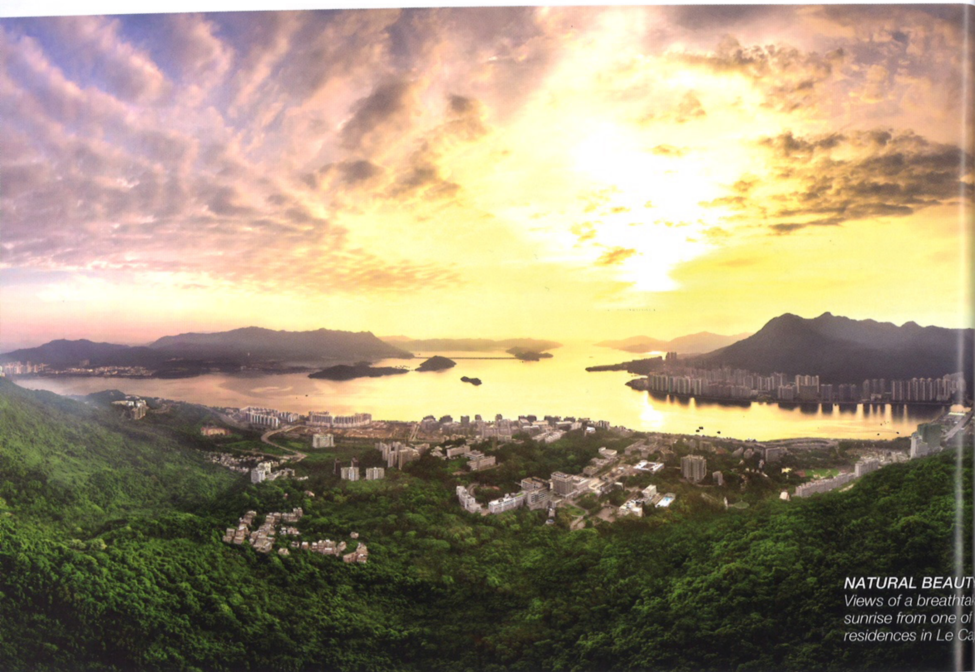
NATURAL BEAUTY Views of a breathtaking sunrise from one of residences in Le Cap.

First glimpsed through an enticing wrought-iron gate, Le Cap is a highly individual development in Hong Kong's unspoilt Kau To Shan area. While within convenient reach of the bustling city, this serene, wooded spot is utterly unique in Hong Kong. Standing on the peak of Kau To Shan, Le Cap enjoys breathtaking views of its verdant slopes, Tolo Harbour and the azure ocean.