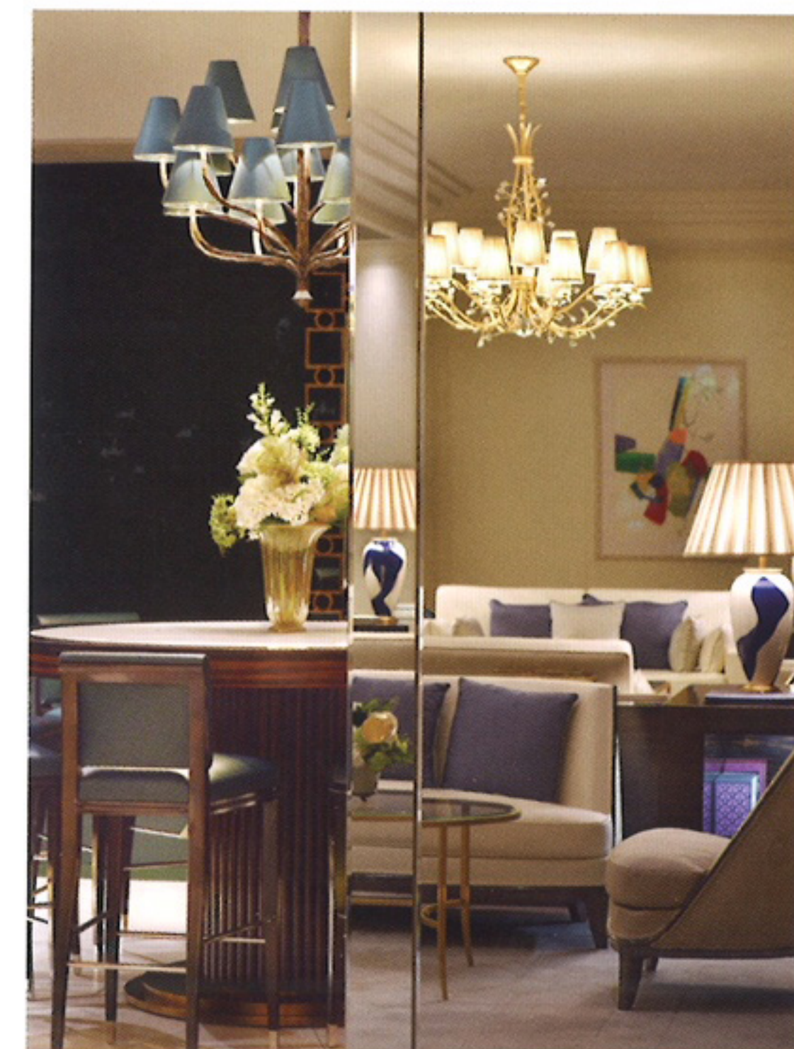
RESTFUL SPACES From top: Le Cap's Clubhouse opens to a relaxing swimming pool; the common rooms of the Clubhouse designed by Pierre-Yves Rochon

"The buildings' design draws on the 1920s and 1930s modernist architecture of the French Riviera," says Rochon. The area then was synonymous with a luxurious lifestyle,