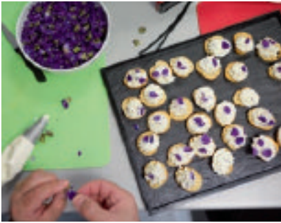
Yves Terrillon (right) runs floral cookery courses, which teach budding chefs how to make inventive dishes like scallops with nasturtiums